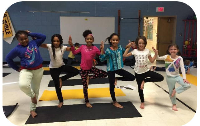
Students at Dr. Cleveland Steward Jr. practicing their yoga skills.

This year, Dr. Cleveland Steward Jr. Elementary will use their Champion Schools grant to purchase desk cycles to be used by their third grade students. These new desks will promote physical activity in a fun, new way, provide “brain breaks” for the students and help keep them engaged throughout the day.