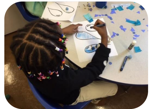
A student from Chartiers working on some rain drops for the garden-themed mural created last school year.

Chartiers Early Learning Center will use their Champion Schools grant to plant a community garden! Children and families will be encouraged to participate in student learning by contributing to a class healthy recipe book.