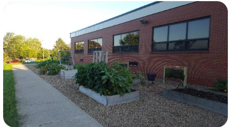
Greenock’s school garden, captured during a past Meet Up.

Greenock will use their Champion Schools grant to teach children that healthy snacks can be inexpensive, easy to prepare and delicious. Children and families will learn nutrition basics, portion sizes, proper food handling and essential cooking skills. This program will complement Greenock’s existing programming, which includes a combination science and cooking class called “Eat Your Science,” as well as their Kids of Steel Running Program.