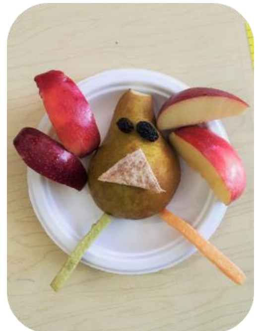
A fruit-filled “Turkey” thanksgiving creation from a Thomas Child Care visit.

Thomas Home Child Care plans to use their Champion Schools grant to maintain their Future Standouts program, a physical activity program that is perfect for the whole family. The child care facility will continue their partnership with Chris Edmonds, founder of the Athletic Training Unit (ATU), to provide an organized exercise program for their children and families on a weekly basis. These sessions will allow families to work out together and have fun at the same time. The ATU food truck will also be on site for families to purchase nutritious meals after their workout.