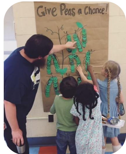
Students from Pittsburgh Montessori add their “peas” to the vine, after giving sugar snap peas a try in their lunchroom.

Pittsburgh Montessori Pre-K – 5 will use their Champion Schools grant to expand their Edible School Yard with edible shrubs, perennials and trees in their pollinator-friendly garden. The gardens support GROW Pittsburgh and seek to increase children’s familiarity with fresh fruits and vegetables.