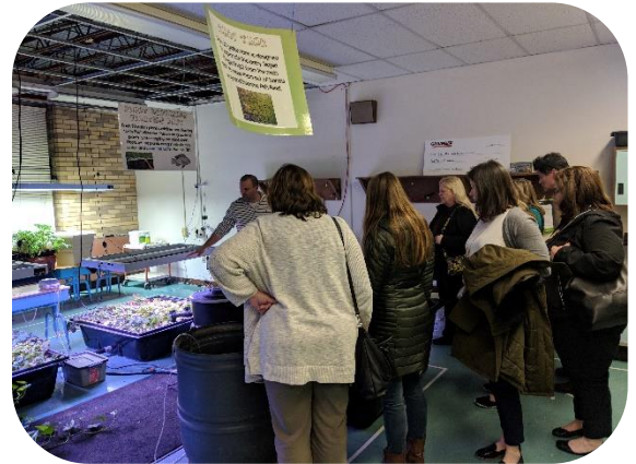
Meet Up at Regency Park Elementary School

Let's Move Pittsburgh launched the Champion Schools program in 2014 with the goal of supporting schools to build healthy environments for their students. In addition to funding for program supplies, Champion Schools Awards recipients receive toolkits with fact sheets, best practices, lesson plans and tips to promote healthier classrooms and lunchrooms. Professional development and networking opportunities are also provided for parents/caregivers, educators, food service staff and administrators. "Meet Ups," which are hosted at Champion Schools sites, allow participants to see other school programs in action.