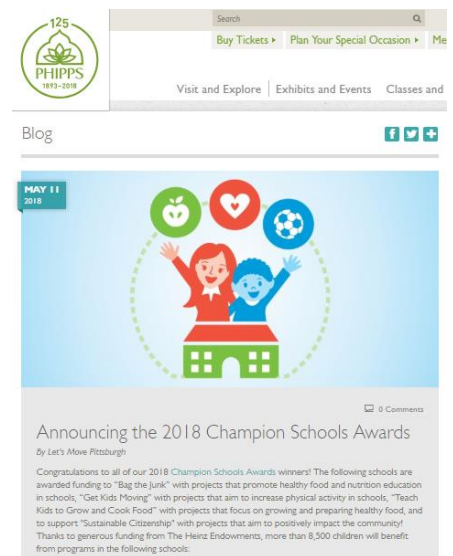
2018 Champion Schools Announcement on website.

Let's Move Pittsburgh strives to give recognition to Champion Schools through press releases and social media for their persistent efforts to integrate healthy lifestyles into the school setting. Champion Schools are invited to write a guest blog post on the Phipps blog that is also shared in our monthly Let's Move Pittsburgh e-newsletter. In 2017, Champion Schools were also invited to showcase their work at the Let's Move Pittsburgh biennial Symposium. At the symposium, Champion Schools were given the opportunity to share their work with parents, caregivers, health professionals and community providers through an interactive poster session. In addition, all schools receive a Champion School sticker to display in their school.