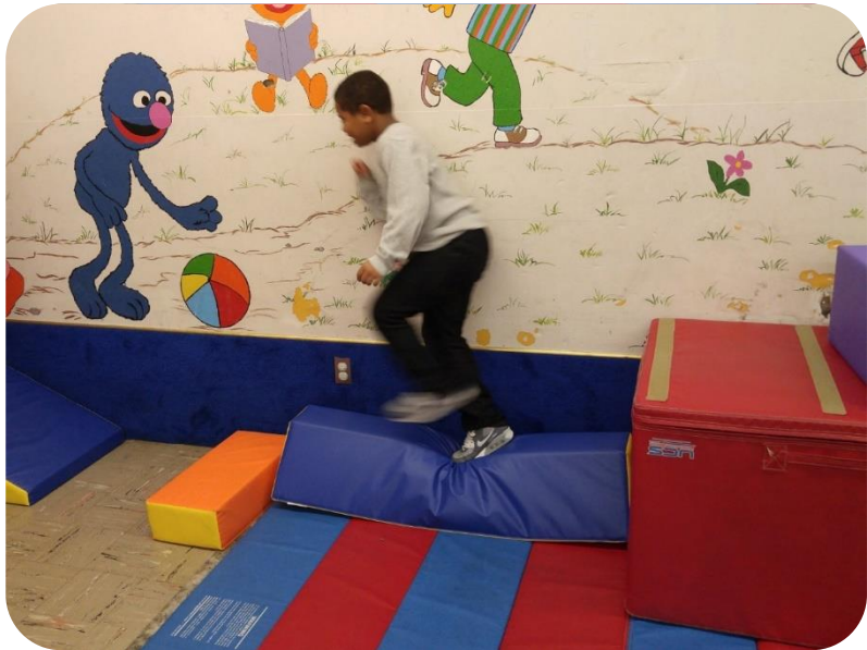
Kids playing in recreation area on equipment purchased with grant funds

socialization through play. PLEA’s wellness initiative will provide a play center, new equipment, and more daily physical activity time for children. Successful activities include building with Legos, playing with trains and pretend play with plastic food, which equip students with the prerequisite skills needed to have friends.