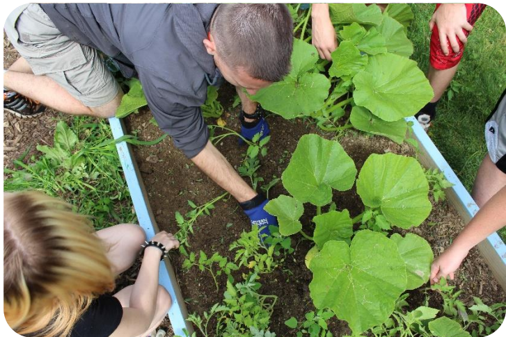
Photo of Rachel's Neighborhood Garden

The Hiland School Garden project installed raised garden beds on the center's campus, allowing students to plant seeds, grow plants and taste locally grown fresh fruits and vegetables. Hiland is committed to community involvement by bringing parents and caregivers to visit the garden and staying connected to the Rachel's Neighborhood Garden located at Allegheny Valley School District grounds. Students using the garden are able to draw pictures of what they did to the garden to help get it ready and identify what they grew in the garden. Students will use a journal over the summer to document the garden transformation.