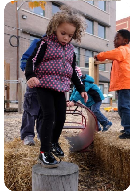
Kids on new playground

Shady Lane School transformed its outdoor play area into a Neighborhood of Make-Believe, where students run, play and learn about gardening with fruits and vegetables. With the transformation, enrolled children will increase the amount of time they spend playing each day and enjoy healthy snacks in the play area and garden. Parents and caregivers at Shady Lane School are critical in the development stages and the success of the play space and food service. Educators now write daily to all parents summarizing playground activities and tips to continue the activities at home. Shady Lane parents desire to have healthy snacks and lunches served and are working with the school to tailor menus. Shady Lane proudly reports that children are now eating far more healthy snacks, many of which they grew over the summer.