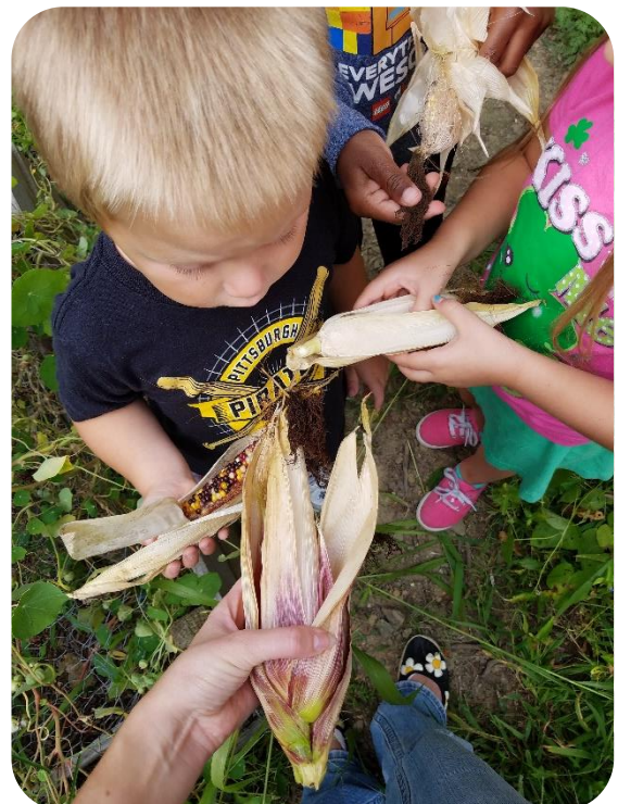
Mt. Washington Children’s Center

Mt. Washington Children’s Center plans to use their Champion Schools grant to continue their Grow with Ro program. This program educates children about fruits and vegetables from seed to harvest through hands-on gardening and educational activities. Teachers will also provide opportunities for the children to taste the fruits of their labor during harvest season! Read more about this project at phipps.conservatory.org/blog/detail/health-in-motion-mt.-washington-childrens-center/