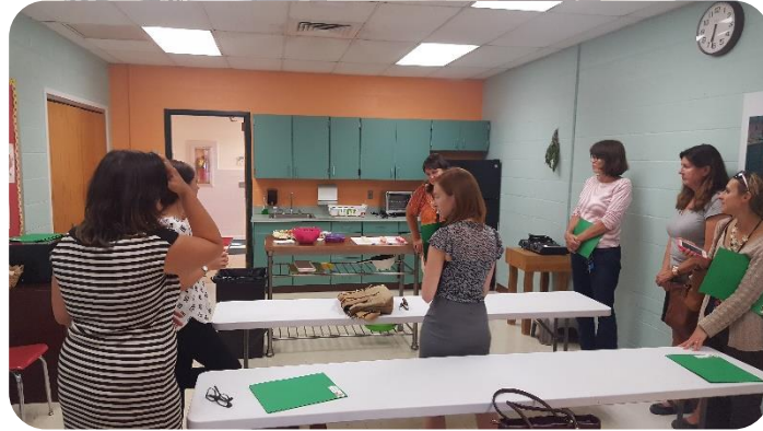
Meet Up at Greenock Elementary School

Let's Move Pittsburgh launched the Champion Schools program in 2014 with the goal of providing funds, tools, networking opportunities and best practices to schools that will help them build healthy environments for children. Champion Schools receive stipends for program supplies, toolkits, fact sheets, lesson plans and other grant sources. Professional development and networking opportunities also are provided for parents/caregivers, educators, food service staff and administrators. Regular "Meet Ups" are hosted at Champion Schools sites that allow recipients to see other school programs in action.