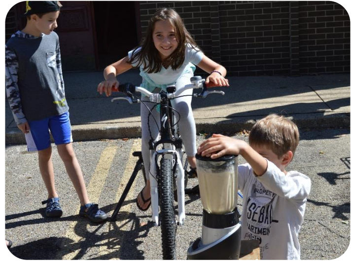
Community Day School Farm Stand

Community Day School will use their Champion Schools grant to continue their CDS Farm Stand After-School program for the third year. Activities take students on a journey from farm to table, starting with soil and composting, then to planting, harvesting and finally food preparation and distribution. This year, students will help install a pollinator garden on campus and taste tests will be provided in the lunchroom for all Community Day School students. Read more about this project at phipps.conservatory.org/blog/detail/health-in-motion-community-day-school-farm-stand