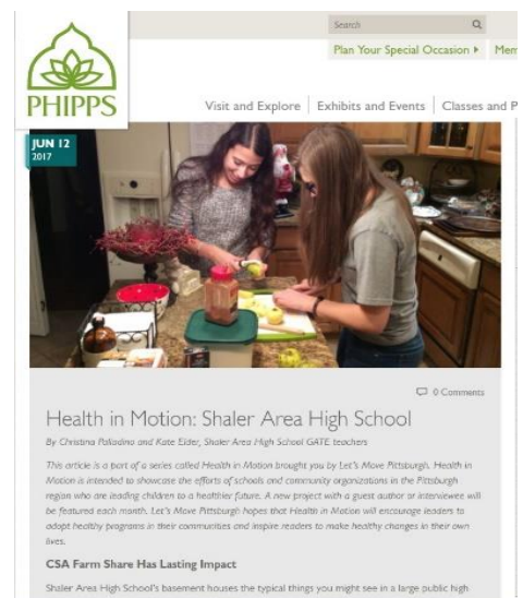
Sample blog post by Shaler Area High School

Let's Move Pittsburgh strives to give recognition to Champion Schools through press releases and social media for their persistent efforts to integrate healthy lifestyles into the school setting. Champion Schools are invited to write a guest blog post on the Phipps blog that is also shared in our monthly Let's Move Pittsburgh e-newsletter. This year, Champion Schools were also invited to showcase their work at the Let's Move Pittsburgh 5-2-1-0 Speakers Series and biennial Symposium. Champion Schools have the opportunity to share their work with parents, caregivers, health professionals and community providers through an interactive poster session. Additionally, all schools receive a Champion School sticker to display in their school.