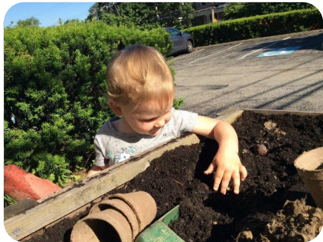
La Escuelita Arcoiris

Their garden committee plans to build two to four raised beds to plant herbs and vegetables to ultimately host an Escuelita Salsa Party for their students and their families.