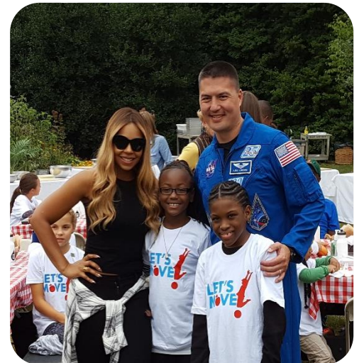
UPCS students at the final White House Garden Harvest to represent the Let's Move! initiative.

Urban Pathways K – 5 will use their grant funds to continue the Urban Pathways Proactive Day Starter (PDS) Smoothie Program. Participating students will arrive for school and immediately make a healthy fruit and vegetable smoothie. After consuming their healthy smoothie, the students will be fueled and ready to have a proactive day of learning. Students will also be exposed to the importance of eating fruits and vegetables during their PE time through various themed games.