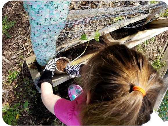
Mt. Washington Children's Center

Let's Move Pittsburgh, a collaborative program of Phipps Conservatory and Botanical Gardens, provides Southwestern Pennsylvania's children and their caregivers with the knowledge, tools and support needed to make nutritious food choices and lead active lifestyles.